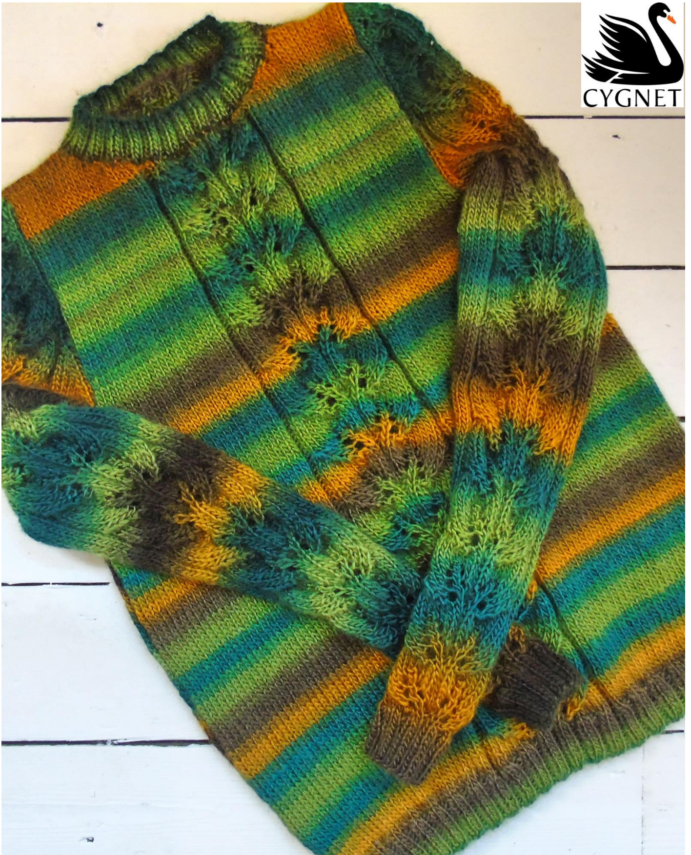
CY1046 Cygnet Boho Spirit Fall Sweater