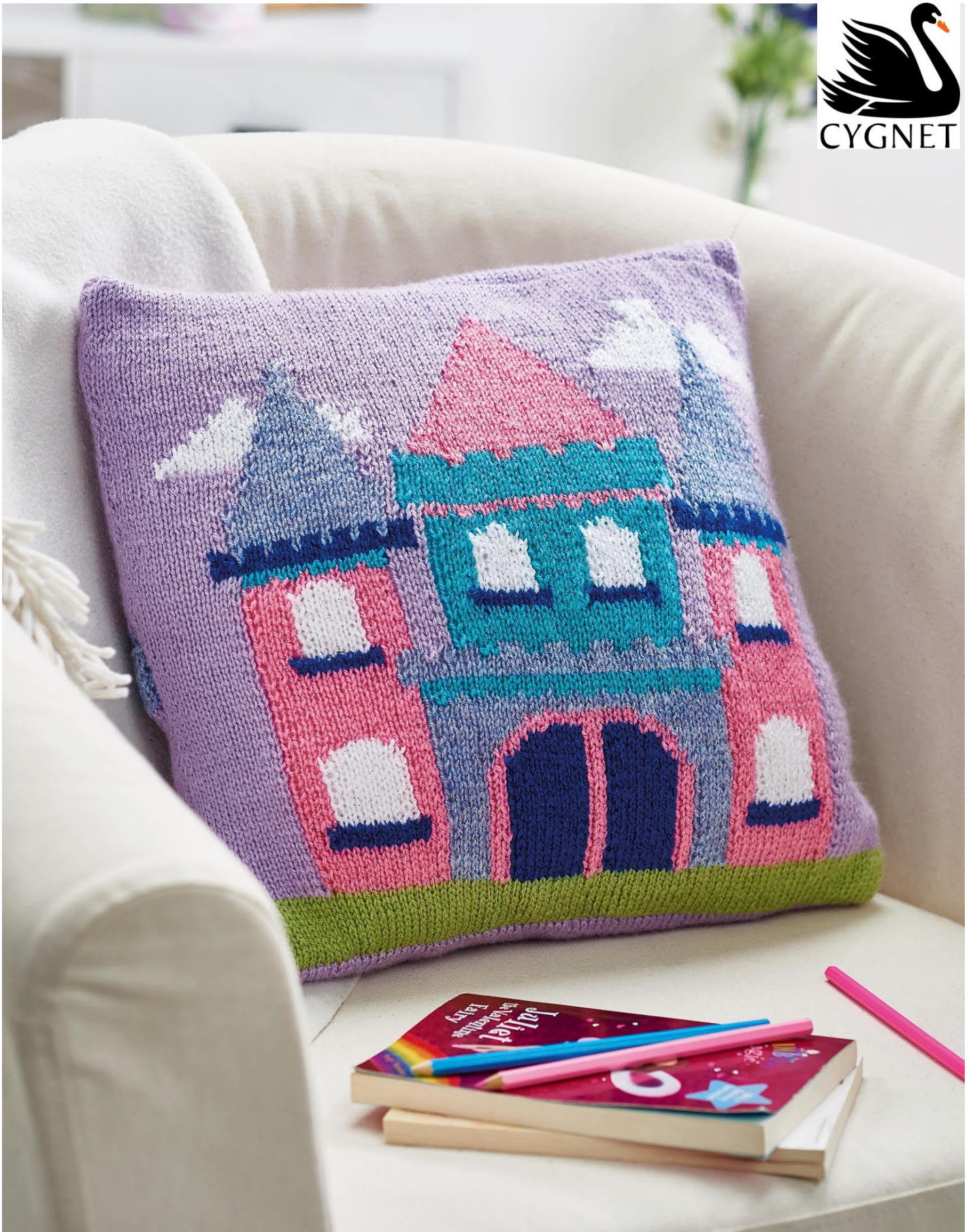
CY1051 Cygnet Glittery DK Princess Castle Cushion