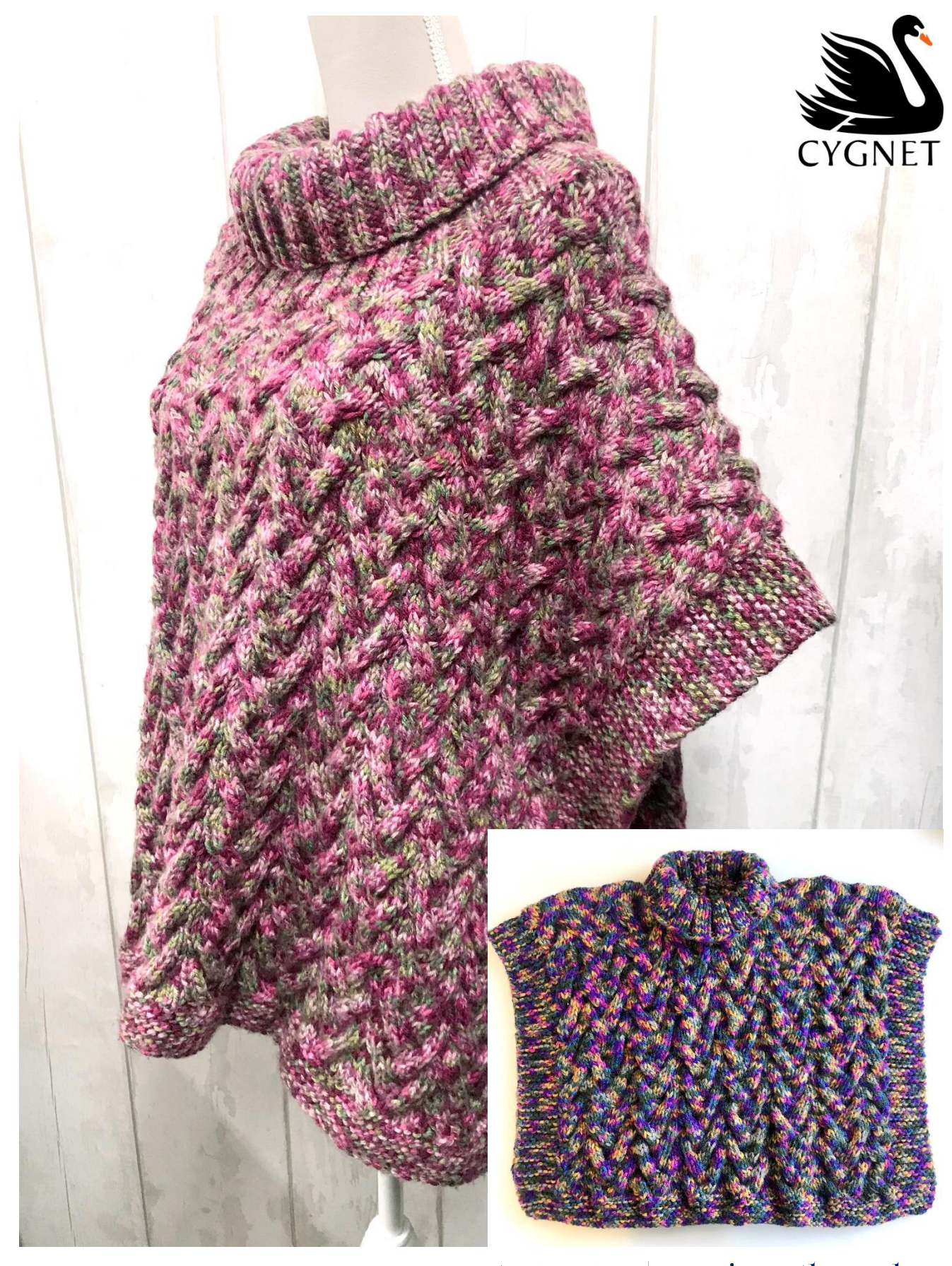
CY1071 Utopia Chunky CABLED PONCHO CHILD/ADULT