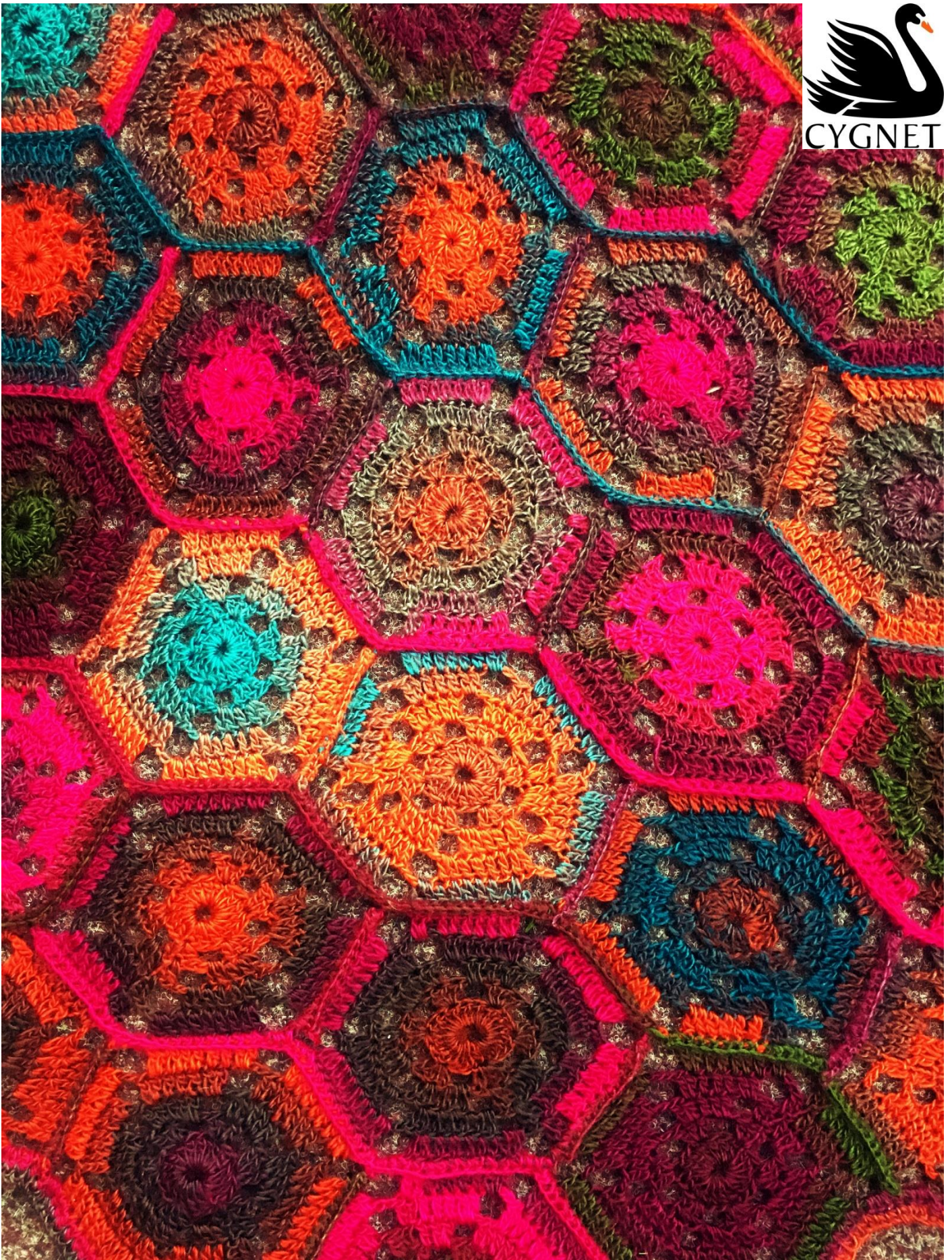
CY1084 Boho Spirit Fantasia Throw